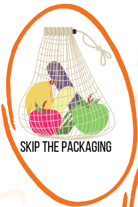
SKIP THE PACKAGING

The first 10 employees to send us proof of completing their actions on August 1st will receive sustainable swag to aid them on their plastic free journey.