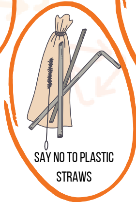
SAY NO TO PLASTIC STRAWS