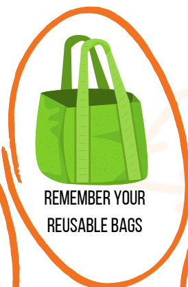
REMEMBER YOUR REUSABLE BAGS