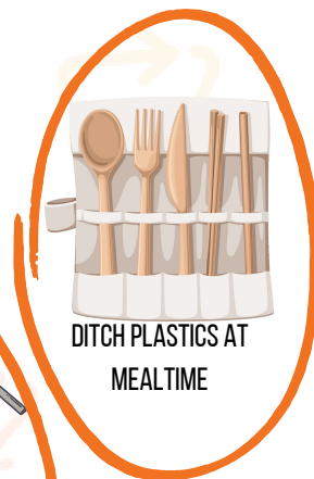
DITCH PLASTICS AT MEALTIME