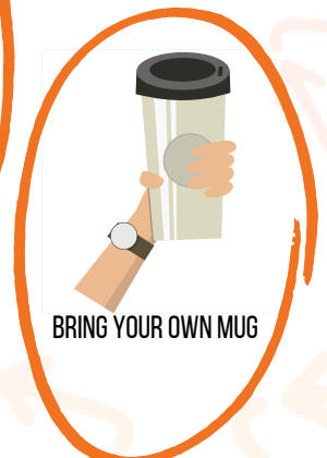
BRING YOUR OWN MUG

“Don't let it stop in July. Explore Climate Resilient VC to learn more on how you can reduce your household emissions and save money in the process!”