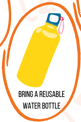
BRING A REUSABLE WATER BOTTLE